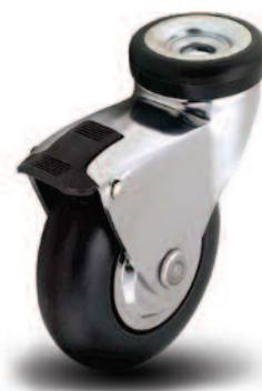
Hole Caster with SOFT NEOPRENE RUBBER WHEELS and Precision Ball Bearings