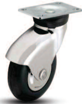
Plate Caster with SOFT NEOPRENE RUBBER WHEELS and Precision Ball Bearings