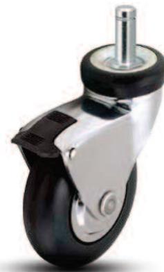
Stem Caster with SOFT NEOPRENE RUBBER WHEELS and Precision Ball Bearings